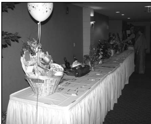
Local restaurants and organizations were very generous in donating food and silent auction items.